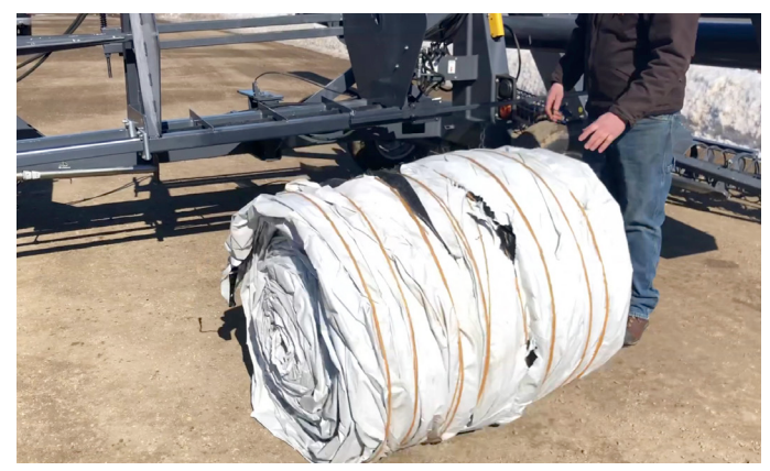
Wrapped & Ready for Recycling