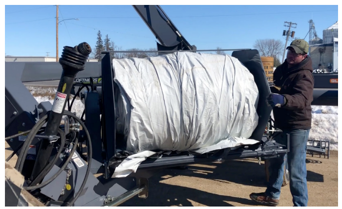
Turn for Tying & Discharge