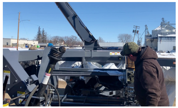
Starting the Bag