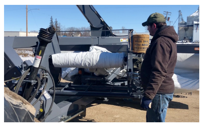
Winding the Bag