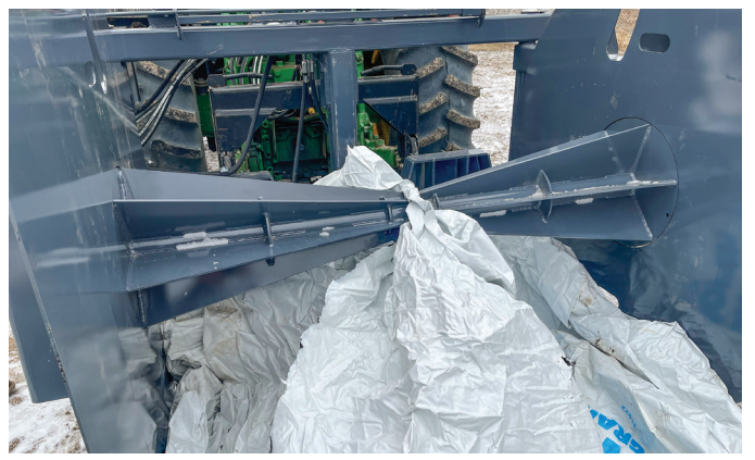
Starting the Bag