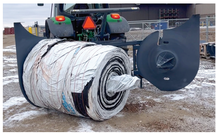
Wrapped & Ready for Recycling