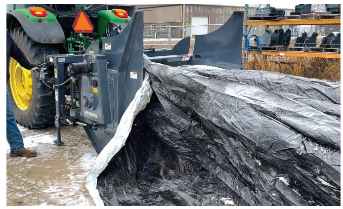
Winding the Bag