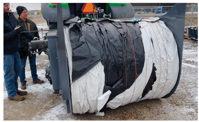
Turn for Tying & Discharge